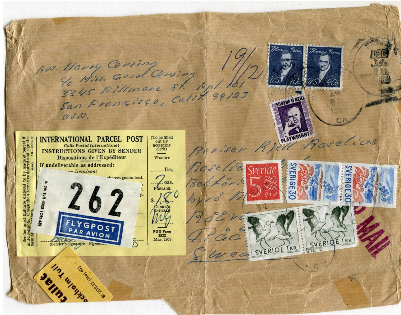
Air parcel rate, 4-8 oz: 135+45=180c Customs handling in Stockholm(9 Jan 1967-30 Dec 1968): 265öre