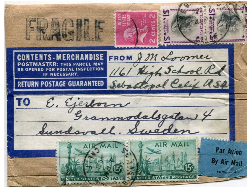
Air mail parcel 12 oz-1 lb: 85+3 \times 49=232c

*The rate change 1 Jul 1971 was first announced as a 10% increase without any list of the amounts, so during the first months two slightly different rates exists depending on how the amount was rounded. As an example an 11th rate parcel can cost 149+10 \times 50=649c or (135+10 \times 45) \times 1.1=644c