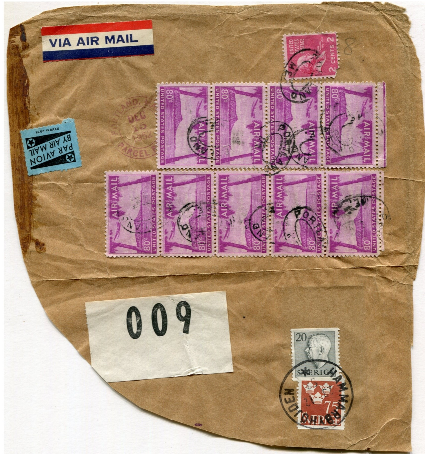
Air Mail Parcel, 3lb 4oz-3lb 8oz, 85+13 \times 49=722c Customs handling in Stockholm(23 May 1952-24 Aug 1955): 95öre

1a. Air Parcel Post 15 Mar 1948-30 Jun 1961