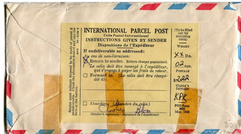
Back side, 80%

Air mail parcel to Sweden by mistake paid at the rate to Switzerland; 0-4 oz: 167c