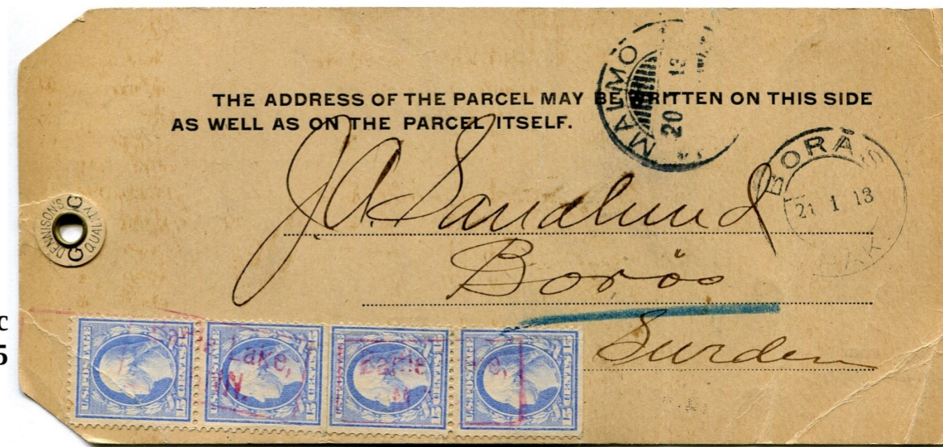
4-5lb parcel: 60c 1 Feb 1906-14 Jun 1925