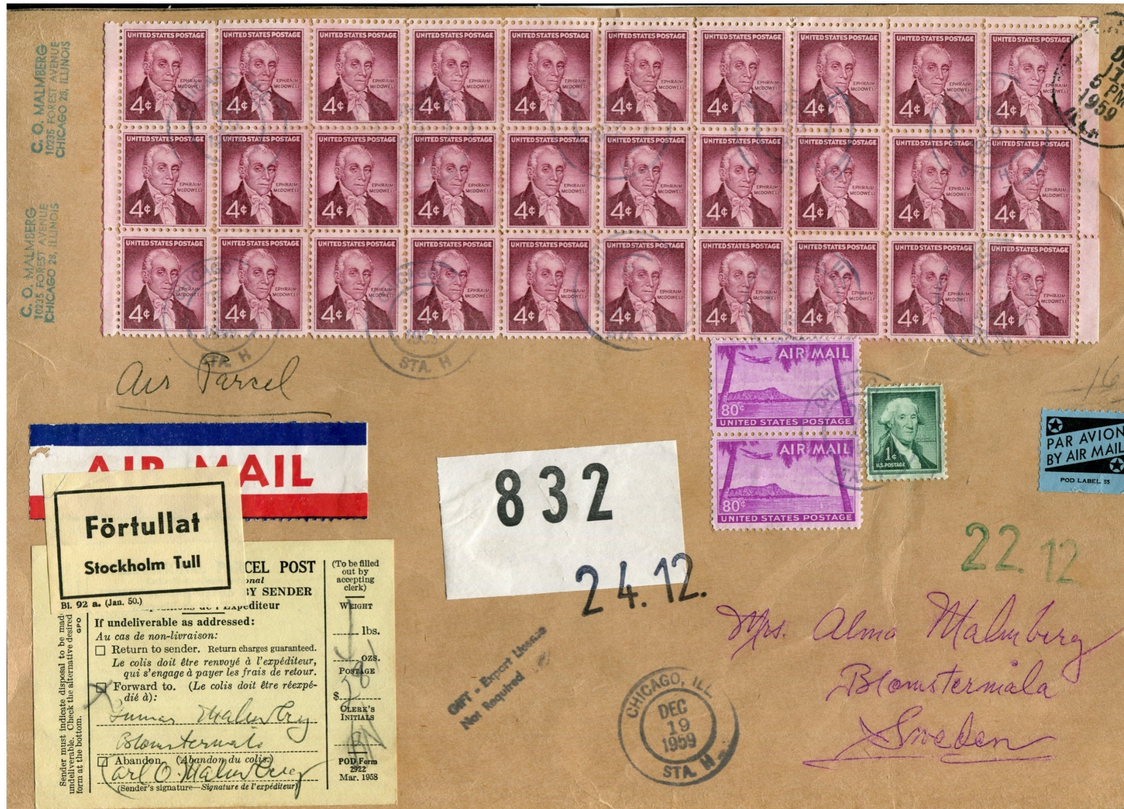
Air mail parcel 1lb – 1lb 4oz, 85+4x49=281c 15 Mar 1948-30 Jun 1961