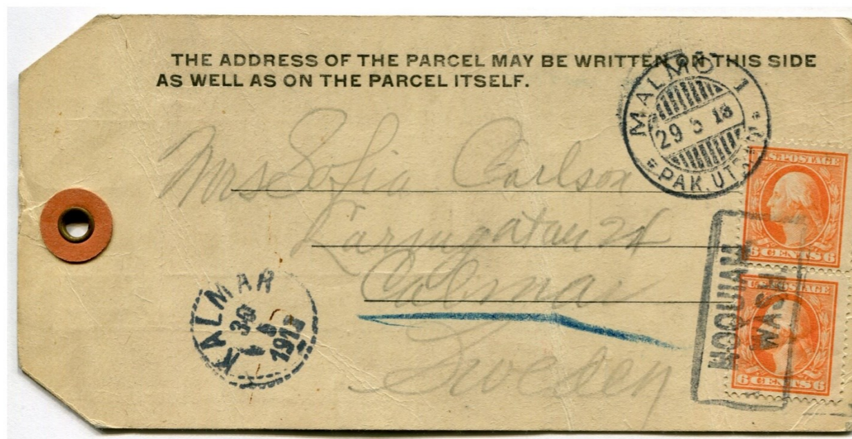
0-1 lb parcel: 12c 1 Feb 1906-14 Jun 1925

* There is no exact date for this change. Postmasters should use it the new rate as soon as Postal Guide 1953 part 2 arrived